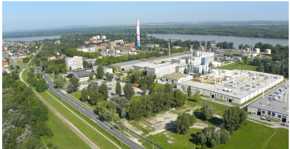
Up to 5000 metric tons of CO 2 savings annually at the Zoltek facility located in Nyergesújfalú, Hungary.