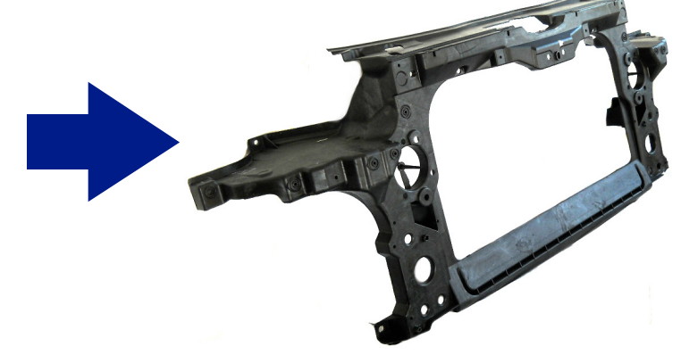
Carbon Fiber Front End Module